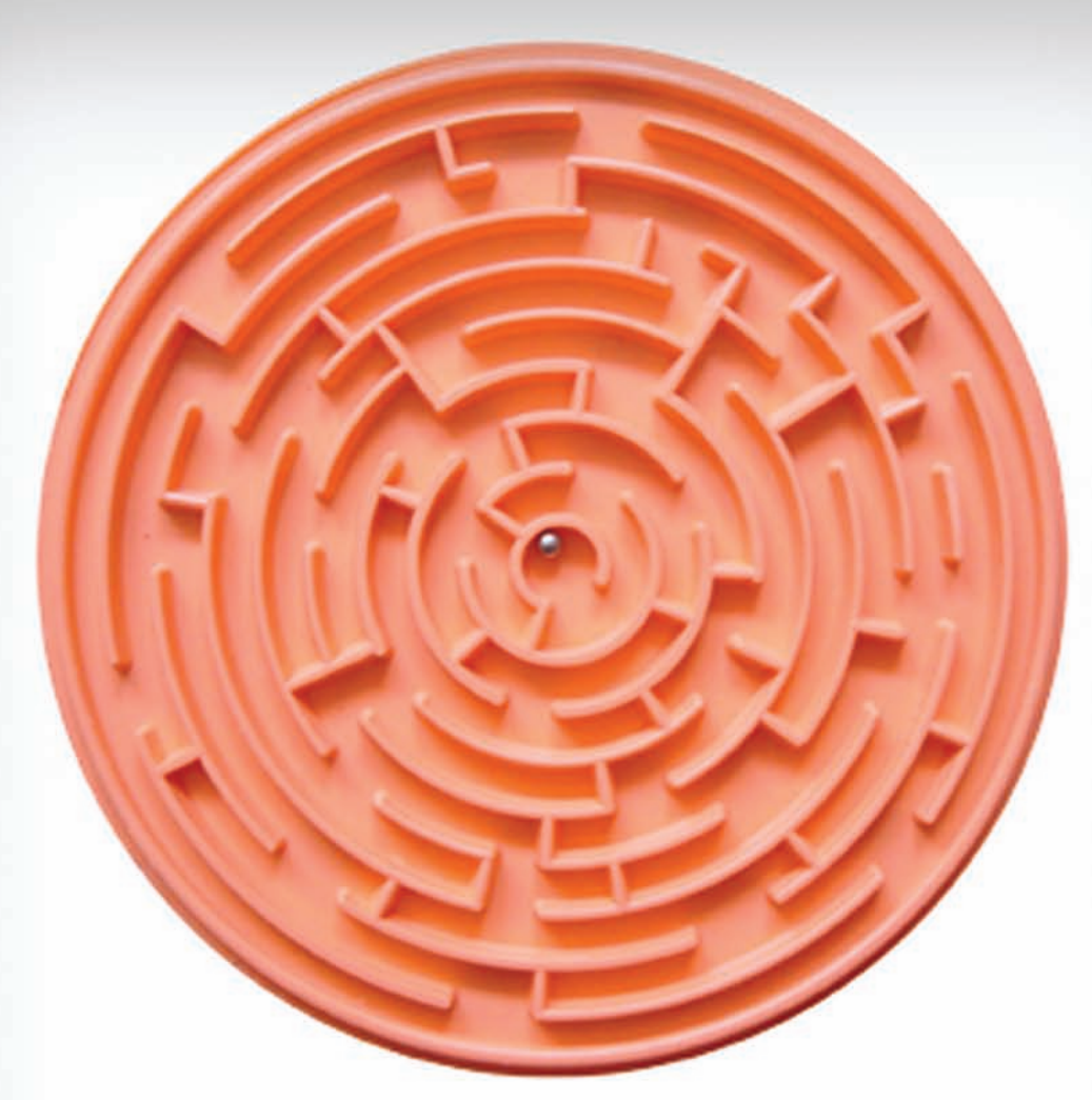
The Better Way to Influence